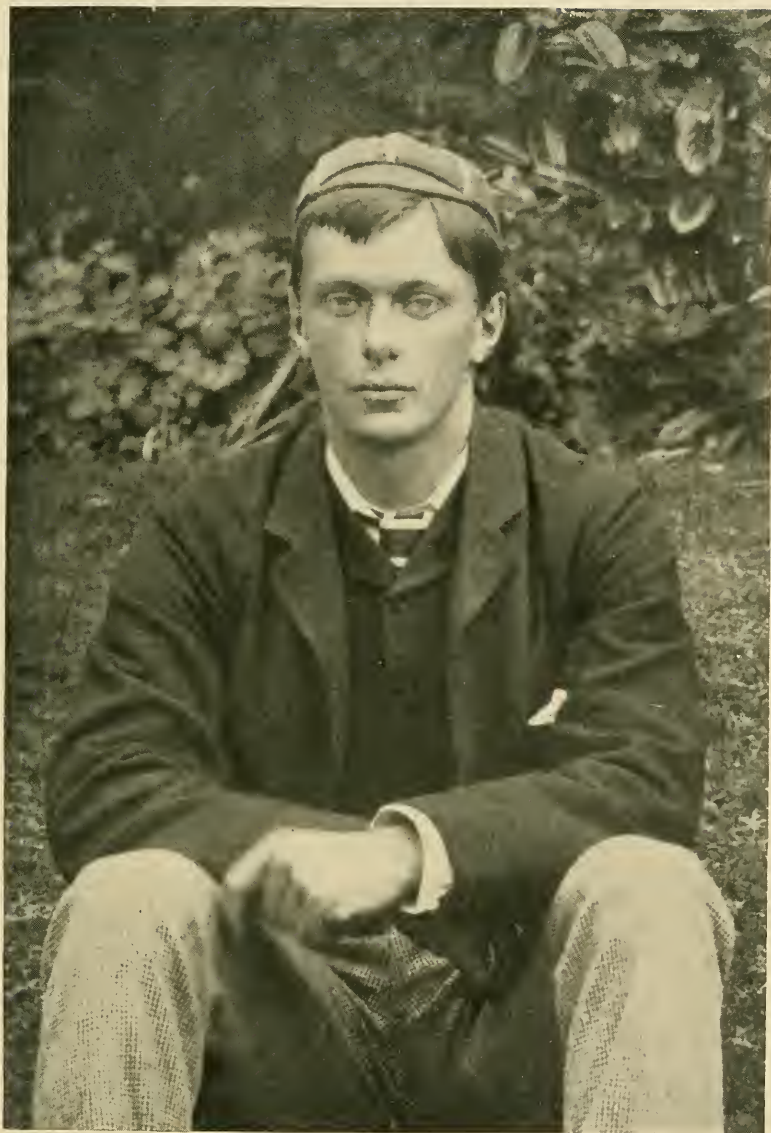
E. F. BENSON, ET. 19